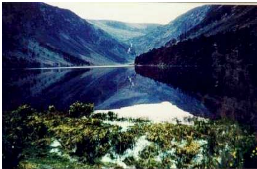
Upper Lake, Glendalough